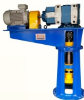
MAGNA TOP ENTRY