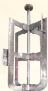
ANCHOR WITH WALL SCRAPER