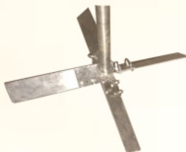
PITCHED BLADE TURBINE (PBT)