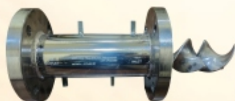
STHIR STATIC MIXER