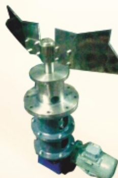
ERTH BOTTOM ENTRY