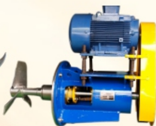
ELECTRON SIDE ENTRY