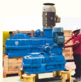
JUMBO TOP ENTRY - HEAVY DUTY