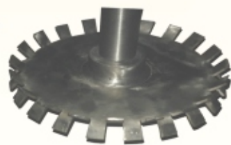
HIGH SHEAR SAW CUTTER