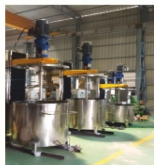
CHEMELEON CHANGE - CAN MODEL