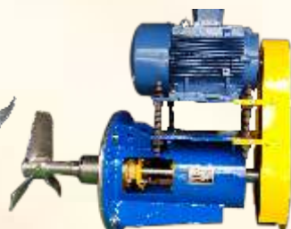
ELECTRON SIDE ENTRY