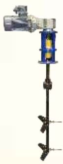
TUSKER TOP ENTRY