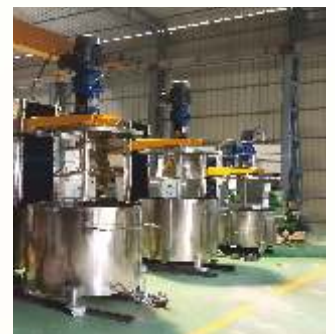
CHEMELEON CHANGE - CAN MODEL