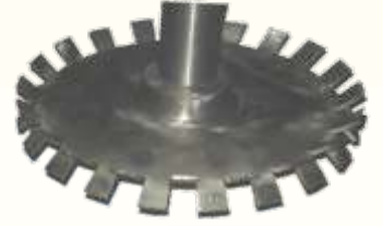
HIGH SHEAR SAW CUTTER