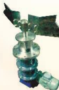
ERTH BOTTOM ENTRY