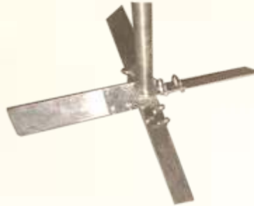
PITCHED BLADE TURBINE (PBT)