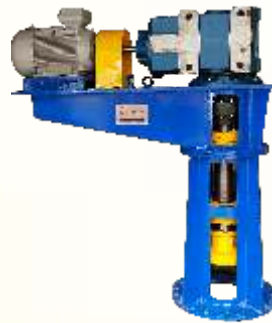
MAGNA TOP ENTRY