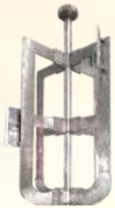
ANCHOR WITH WALL SCRAPPER