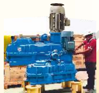
JUMBO TOP ENTRY - HEAVY DUTY