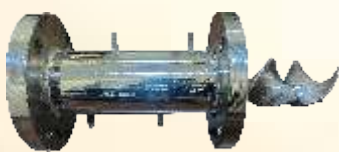
STHIR STATIC MIXER